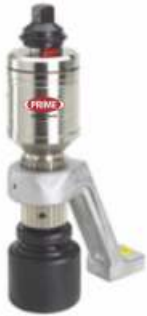
PVR SERIES TORQUE MULTIPLIER

Hand tools are simple tools which you use with your hands, and which are usually not powered also Hand tools is any tool that is powered by hand rather than a motor examples are chopping, chiselling, cutters, files, striking tools, struck or hammered tools.