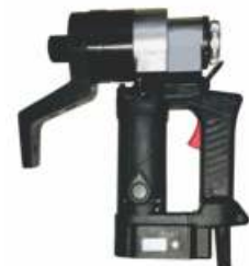
PEWL SERIES ELECTRIC TORQUE WRENCH