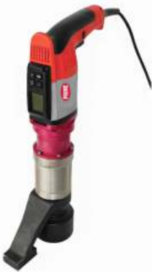
STRAIGHT TYPE ELECTRIC TORQUE WRENCH

A torque wrench is a tool used to control and apply a specific torque to a fastener such as a bolt or a nut.