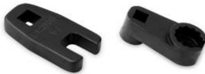
CROW FOOT WRENCHES