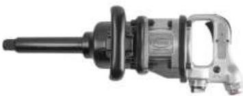
LONG ANVIL PNEUMATIC IMPACT WRENCH