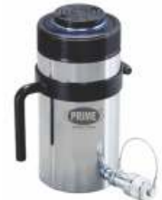
HYDRAULIC JACKS (ALL TYPES)