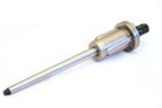
A SERIES BOILER TUBE EXPANDER