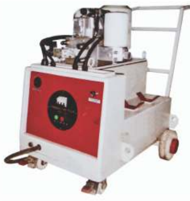
CONTINUOUS TUBE PULLING POWERPACK

Tube cutters are commonly used in manufacturing applications to ensure the proper fit and function of tubing systems. Tube pullers are essential for safely and efficiently removing tubes from heat exchangers, boilers, and other equipment. Put simply, the cleaning process involves removing corrosion and mineral deposits. This is normally achieved using a Electric Tube Cleaning Machine with the Help of Brush and Other tools, or hydro Jet Tube Cleaning Machine.