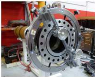
FLANGE FACING MACHINE