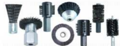
BOILER CLEANING BRUSHES