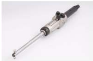
COMBINATION BEADING TUBE EXPANDER