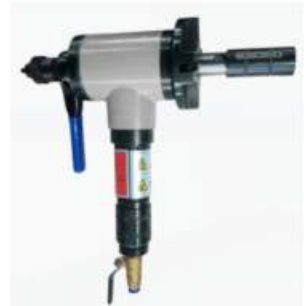
TUBE BEVELLING MACHINE

PRIME TOOLS & EQUIPMENTS PVT. LTD. Corporate office: PRIME HOUSE, B-7/A, Acharya Niketan, Mayur Vihar Phase 1, New Delhi 110 091 Tel: +91-11-43037699 Mobile: +91-9310015460 E-mail: info@primetoolsindia.com Website: www.primetoolsindia.com