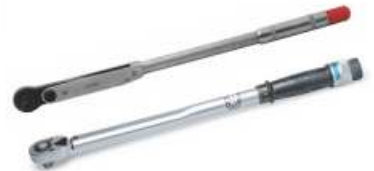
MANUAL TORQUE WRENCH