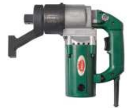
ELECTRIC TORQUE WRENCH