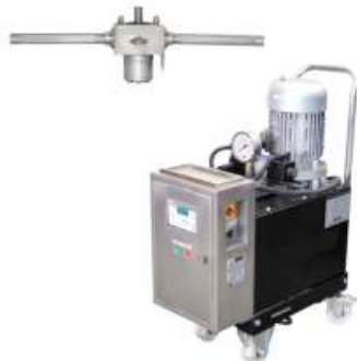
HYDRAULIC TUBE EXPANSION SYSTEM