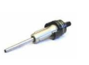
ABF3 SERIES TUBE EXPANDER