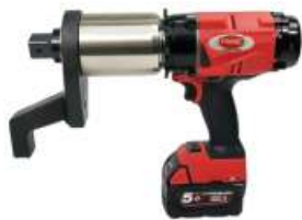
BATTERY TORQUE WRENCH