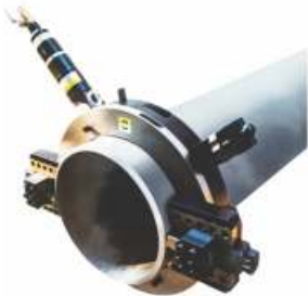
PIPE CUTTING MACHINE

Pipe cutting, or pipe profiling, is a mechanized industrial process that removes material from pipe or tube to create a desired profile. Typical profiles include straight cuts, mitres, saddles and midsection holes. Flange facing is an onsite machining service conducted on a flange to avoid leakages and corrosion. This service helps maintain the joint integrity required between two flange surfaces.