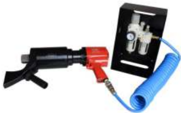
PNEUMATIC TORQUE WRENCH