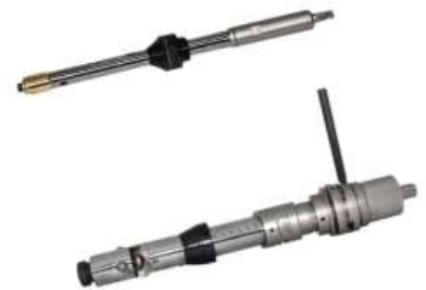
INTERNAL TUBE CUTTER