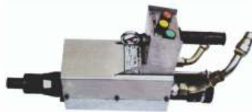
TUBE PULLING GUN