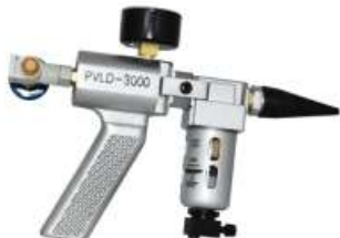
VACUUM TUBE LEAK DETECTOR