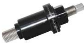
MANUAL TUBE PULLER