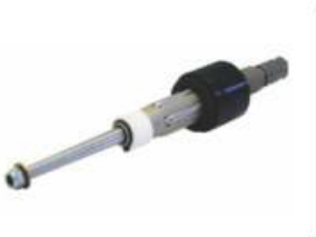
800 SERIES TUBE EXPANDER

Tube Expanders are rolling tube type expansion tools used for fixing and molding tubes to tube sheets in the manufacturing processes of heat exchangers such as boilers and condensers. Proper tube installation is essential for efficient operation of condensers, boilers, and coolers. It involves securing and sealing the tubes to prevent leaks and ensure proper fluid flow.