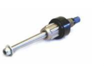
SB SERIES TUBE EXPANDER