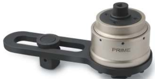
PTM SERIES TORQUE MULTIPLIERS