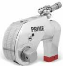
SQUARE DRIVE TYPE HYDRAULIC TORQUE WRENCH

A torque wrench is a tool used to control and apply a specific torque to a fastener such as a bolt or a nut. It is a fundamental element in general industrial maintenance & repair industries, to ensure customers' safety. Tensioning is a controlled way of applying clamping load to the bolt on applications within critical industries such as oil and gas, wind energy, construction and nuclear etc. This is done by stretching the bolt to the initial load.