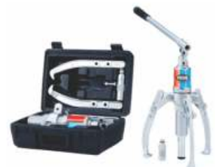
HYDRAULIC BEARING PULLERS