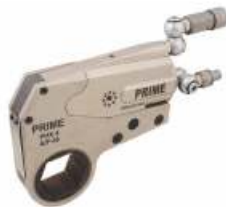
HEX TYPE HYDRAULIC TORQUE WRENCH