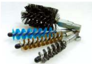
CONDENSER TUBE CLEANING BRUSHES