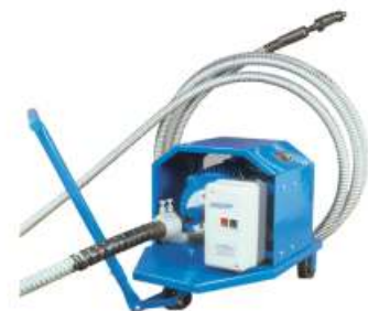
BOILER TUBE CLEANING MACHINE