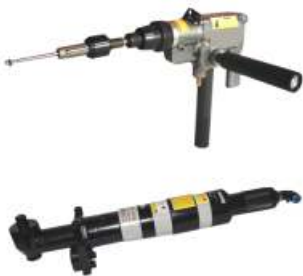
PNEUMATIC TUBE EXPANSION DRIVE