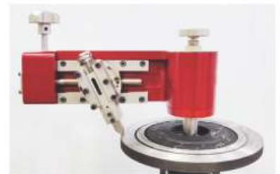
MANUAL FLANGE FACING MACHINE