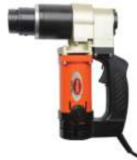
ELECTRIC SHEAR WRENCH