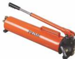
HYDRAULIC HAND PUMP