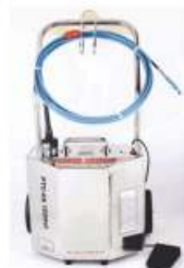
CONDENSER TUBE CLEANING MACHINE