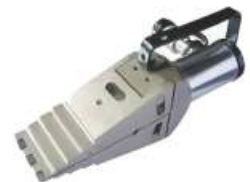
HYDRAULIC FLANGE SPREADER