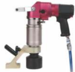
ANGLE TYPE PNEUMATIC TORQUE WRENCH