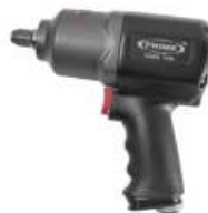
PNEUMATIC IMPACT WRENCH